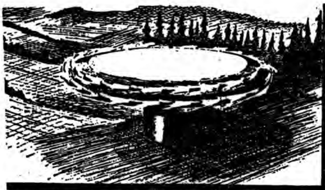
Conning Tower Sinks As the Disc Spins

CONCLUSIONS: This is probably the most doubtful of all landing reports for this period, and is probably propaganda material only.